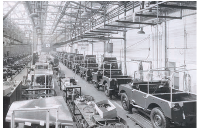
Above centre, left and right: A complete rolling chassis, correctly painted green, ready to leave Dunsfold for the recreated Series 1 production line at Solihull

I’m sometimes asked what I think about the Defender coming to an end. This may surprise you, but my opinion is – bring it on! The Defender is a vehicle designed for another age. I have every confidence that whatever replaces it will be just as impressive. And for a well-upholstered person like myself, it will certainly be a lot more comfortable to drive.