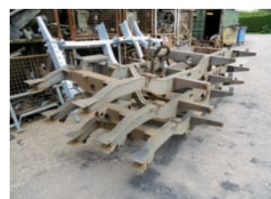
Clockwise from top: Loading a 'new build' Series 1 for transport to Solihull; 1949-spec chassis from the Series One Club; fully refurbished engines

new-old-stock from the Dunsfold stores. We only resorted to reconditioned secondhand parts for the bigger items, like engine blocks or gearbox cases, which can no longer be found brand new.