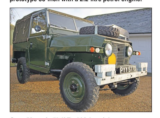
One of just six 'Half Ton' Lightweight prototypes built for Ministry of Defence evaluation in 1966, it's now been beautifully restored after wading and sea trials had taken their toll