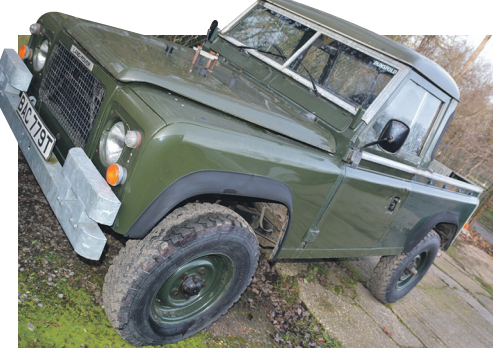
This 100-inch chassis prototype Land Rover from 1978 was built for the Swiss and French armies to test with a V8 engine and 24v electrics.