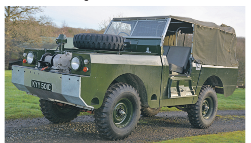
The amazing OTAL could cross rivers propelled and steered by its own wheels. Featuring an all-aluminium body and straight-six engine, it's an impressive and totally unique vehicle.