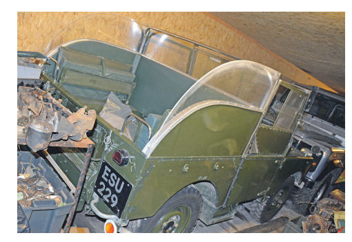
By Royal Appointment, the Rolls-Royce powered Ceremonial Land Rover, It's one of 33 built, this