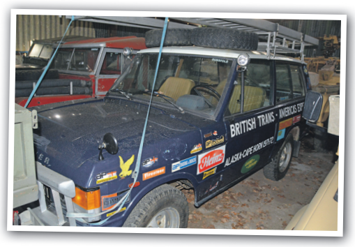
Alaska to Cape Horn began in December 1971 and was completed the following August after 18,000 miles of the Pan American Highway.