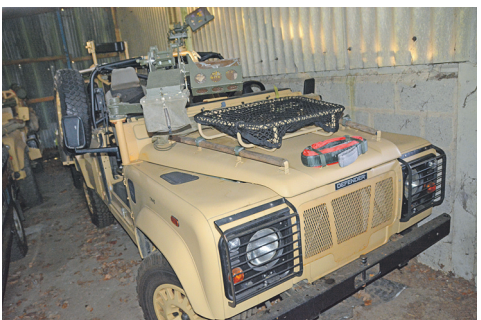
The Defender Wolf 110 WMIK (Weapons Mounted Installation Kit) demonstrator from 2002 enjoyed a 2.5-litre TDi engine, plus front- and top-